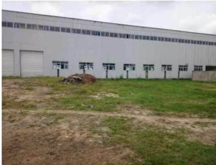
Fabrication Yard in Pictures