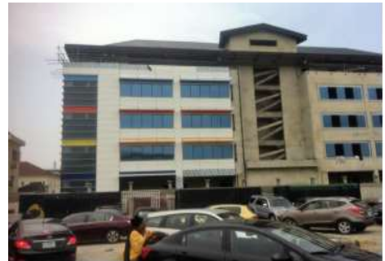
New Head Office Complex in Pictures